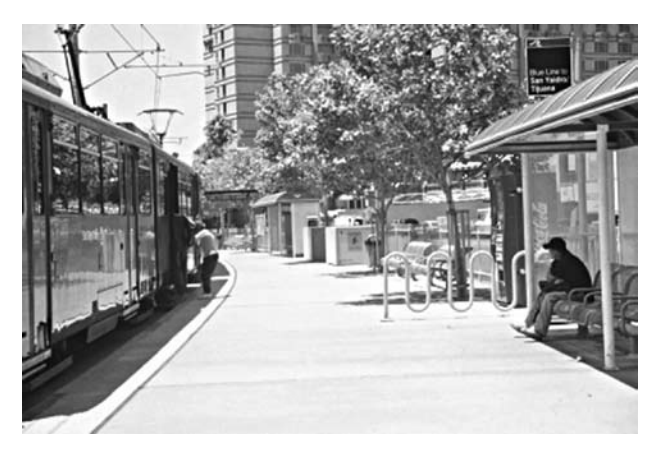
Figure 2. Hazard Center Station TOD in San Diego