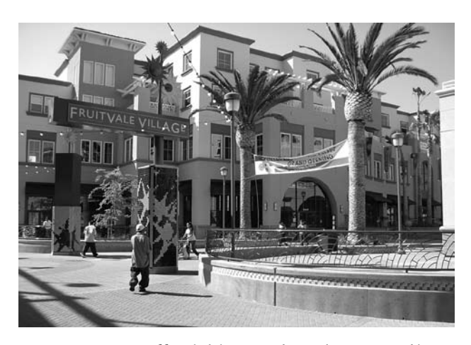
Figure 1. Compact Affordable Housing above Retail Next to the Train Station in Oakland's Fruitvale Transit Village

I'd say that absent such a policy, the pattern would be more diffuse in that you'd still see 80 percent of the affordable multifamily housing as infill housing, but perhaps not as transit accessible. I think it's relatively easier for affordable housing to be financed as part of TODs in California as a result of these policies (Shoemaker 2004).