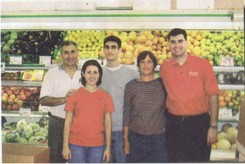
Dad, me, Hunter, Mom, and Gregory at Ferrara Supermarket Photo courtesy of Associated Grocers' Ink , Oct. 29, 2001