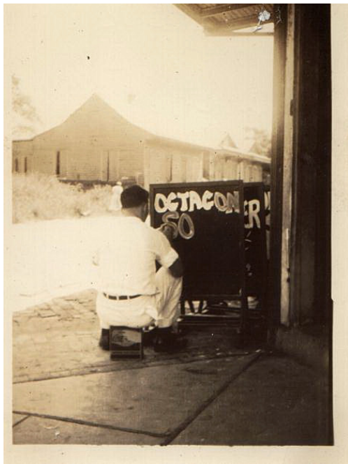
Grandpa painting signs outside of Ferrara's Food Store