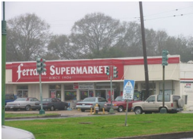
Ferrara Supermarket at Elysian Fields Avenue and Robert E. Lee Boulevard