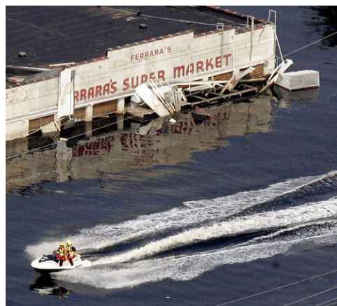
Ferrara's after Hurricane Katrina