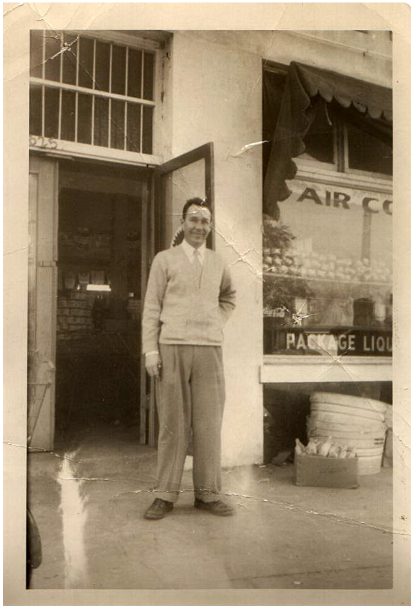
The grocery man