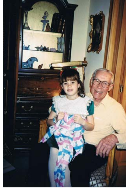
Grandpa and me