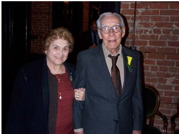
Grandma and Grandpa