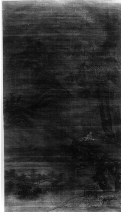
Fig. 6. Anonymous (Ming Period, 1368–1644), Scholar Under a Tree in Autumn

The museum that boasted “the finest collection of oriental art under one roof in the world” was, nevertheless, the Boston Museum of Fine Arts (Okakura’s phrase, qtd. in Fontein 6). Between 1905 and 1913, Kakuzo Okakura (1862–1913), as successor of Fenollosa and curator of the Department of Asiatic Art (then the Department of Japanese Art), made an extraordinary effort to consolidate this reputation by acquiring among other things many more Song and Kamakura-Muromachi (fourteenth- to fifteenth-century Japanese) paintings. These included such masterpieces as the hanging scroll A Luohan Contemplating a Lotus Pond referred to earlier, the handscroll Clear Weather in the Valley formerly attributed to the Northern (or Early) Song painter Dong Yuan (907–960), Ma Yuan’s round album leaf Bare Willows and Distant Mountains , and the Muromachi painter Bunsei’s hanging scroll Landscape (fig. 7). John Gould Fletcher, who visited the Boston Museum of Fine Arts in 1914, was so overwhelmed by its