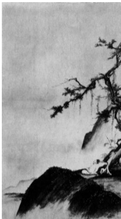
Fig. 3. Attributed to Huizong (1082–1135), A Scholar Seated Under a Pine Tree Reproduced from Ernest Fenollosa, Epochs of Chinese and Japanese Art , Vol. 2 (1912)

The poem is, therefore, more likely to have been inspired by stored images, 7 that is, Stevens' reminiscence of other Chinese landscape paintings repeating Ma Yuan's favorite theme. He might have seen one example of this tradition with admiration, and then another and another, in books and in art galleries. As he observes in his 1951 article on "The Relations between Poetry and Painting," "The mind retains experience, so that long after the experience . . . that faculty within us of which I have spoken makes its own constructions out of that experience" (NA 164). Here his theorizing sounds like Chan. Several facts appear to point to the truth of my assumption. First, as an enthusiastic admirer of Chinese landscape painting, Stevens went to quite a few exhibitions of Far Eastern art in Boston and New York during the years 1897–1916. Second, his interest in Oriental art spurred him to study the subject extensively in 1908–1909. Third, in his reading and viewing of Chinese art his taste appeared specially for Song landscape painting that illustrates the Tao or the Chan with "unnatural" clarity.