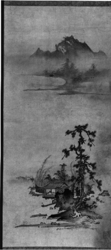
Fig. 7 Bunsei (active mid-fifteenth century), Landscape Hanging scroll, ink and light color on paper, 29 x 13" Chinese and Japanese Special Fund

notes into his journal. These included passages from Kakuso Okakura's The Ideals of the East (1903) and Laurence Binyon's Painting in the Far East (1908). It was Okakura's The Ideals of the East rather than Beal's Buddhism in China that first introduced Stevens to Chan Buddhism. From The Ideals of the East he might have acquired an understanding of Neo-Confucianism, "an amalgamation of Taoist, Buddhist, and Confucian thought, acting chiefly . . . through the Taoist mind" (156); and of the Chan, "introduced into China" through India but thoroughly transformed by absorbing "Laoist [Taoist] ideas" (160). That Stevens had carefully read Okakura is evidenced by his sensible statement, "Kakuzo Okakura is a cultivated, but not an original thinker" (SP 221). He seemed to think more highly of