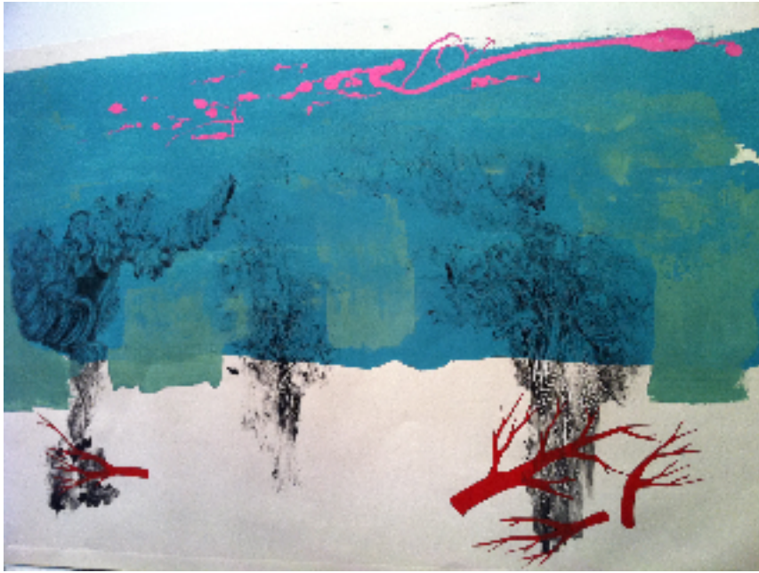
Figure 1. The End of the World. 2009