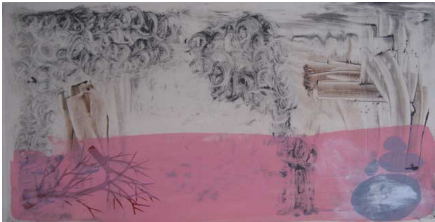
Figure 2. The Stones That Were Left, 2009.