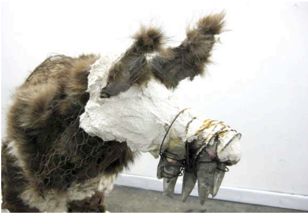
Figure 4. The Wolf. 2009

coats, it represents a time when there were predators in woods, it stands trapped in a chicken wire cage and bound with wire reminding us that the only wolves that we can find in America today are the ones that live their lives in cages till they are ready to be skinned for their hides.