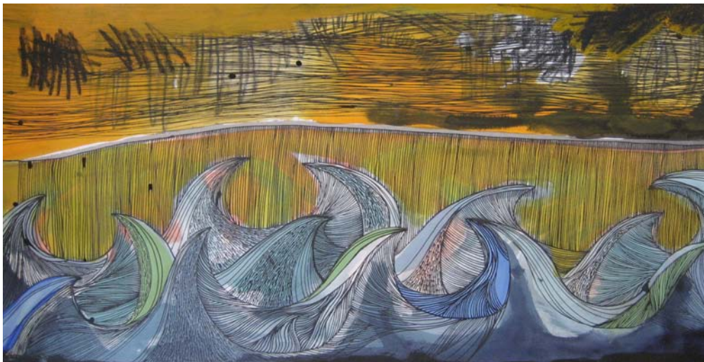
Figure 8. Seascape 1. 2010

The charcoal lines become gestural in the sky. The lines are heavy, dark and messy suggesting an angry storm. The waves rise up out of the sea as a sharp form. The water is multicolored and artificial, as though the water is full of gasoline. Again, as in other pieces, I am using colors to represent a toxic element. There are no people, land or animals in this painting, only water.