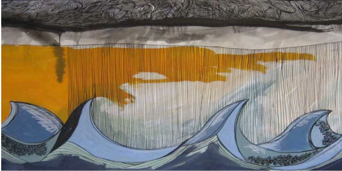
Figure 9. Seascape 2. 2010

In "Seascape 2" the anger and aggression is a little more subtle. There is a light water color gestural painting that is slightly hidden behind a wash of vertical ink drawn lines. This gestural painting is of a turbulent sea. The sky is dark and menacing in this painting and yet again the waves appear sharp and dangerous. In my end of the world, the seas are rising because the ice caps have melted and the erratic change in weather has created huge hurricanes and storms. The water in these seascapes are illustrative of a time that I imagine will happen.