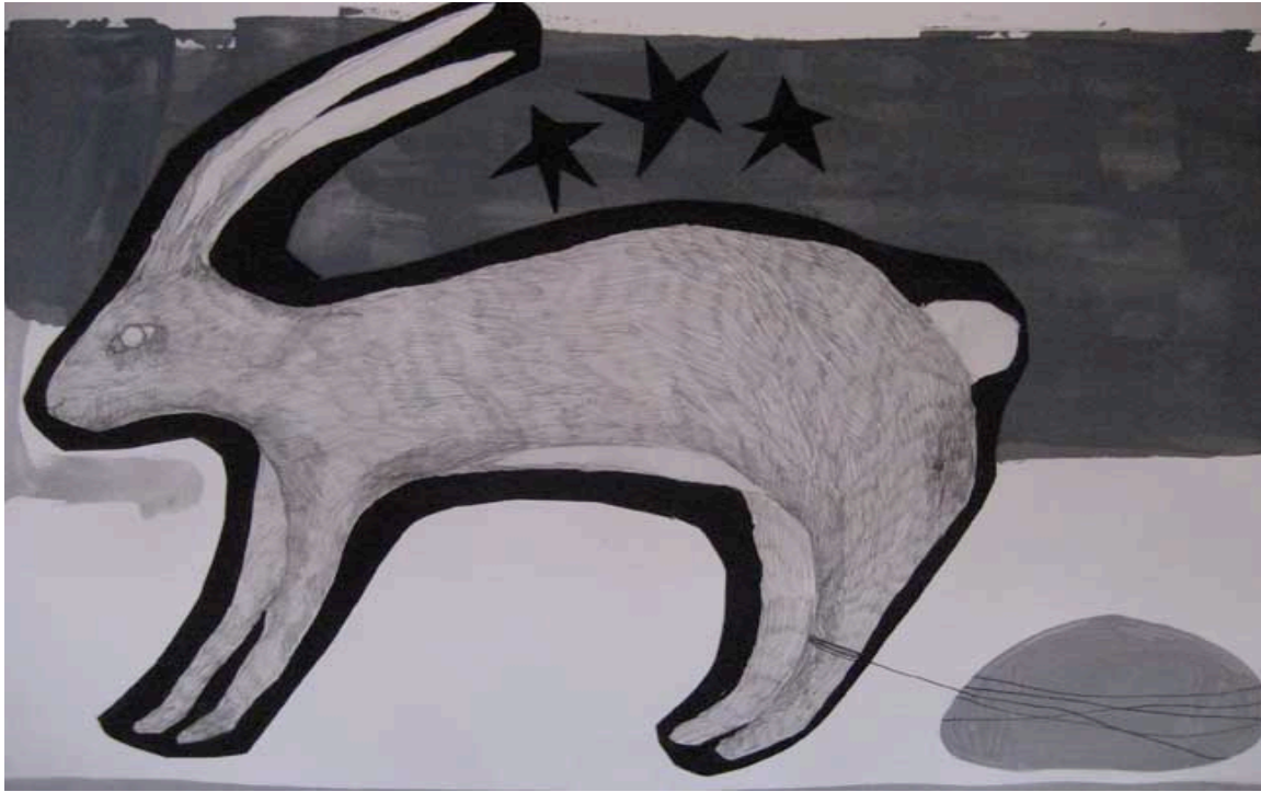
Figure 6. Rabbit Tied To A Stone, 2010.