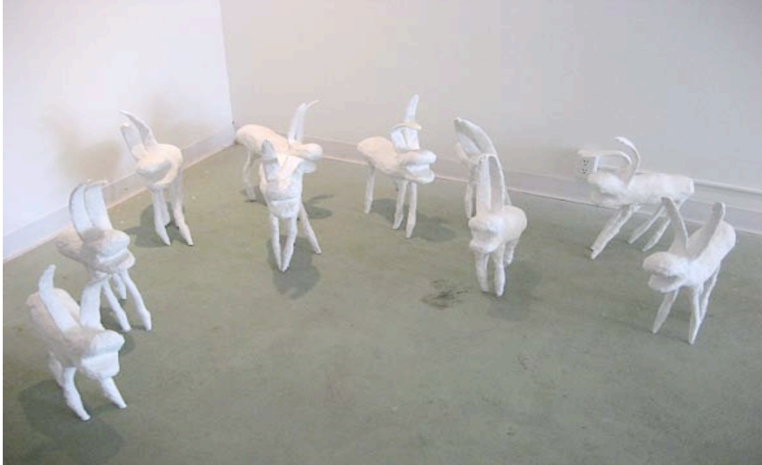
Figure 5. The Decision, 2008.

This piece is an interactive installation piece. A person must stand in front of the rabbits in order for the piece to activate as art. When the viewer steps in front of the piece I hope for there to be a confrontation of ideas. I want the viewer to be confronted about how they feel in front of these rabbit creatures. The rabbits have their mouths open, are they speaking to the viewer, about to eat the viewer, laughing at the viewer? Their pointed feet could be depicted as delicate or as weapons. I wanted this piece to speak about the relationship that humans have with the natural animal world and how that relationship is a highly personalized one.