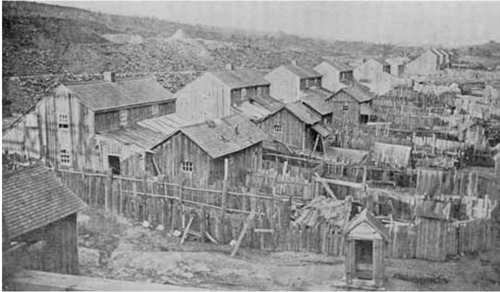
Figure 4. Photograph of Patch Town in Luzerne County

Mine owners lived away from the vicinity of the mines. Their homes were often located along the Susquehanna River bank; the houses were elegant and spacious. On the other hand, class of workers divided the patch towns, and the layout of the village was the same in all coal-mining towns. At the beginning of the street, there were large single houses where the mine bosses and supervisors lived with all the most available comforts for the time. The next section was the miner's homes, usually separated by ethnic origin, which consisted of two rooms plus a kitchen, and a big room downstairs and a big room upstairs where the children slept. The outside was wood and covered with strips of cardboard or cloth to keep out the rain. These houses, which were usually shared by two or more families, had farm animals in the yard and, last but not least, the single outhouse. At the end of the streets or on one side of the street would be where the unskilled workers lived. The main water pump was a gathering place used for everything from drinking to laundry, was shared by many families (Bartoletti, 1996). Miller and Sharpless (1985) have best described the miner's living conditions of the late nineteenth and early twentieth century by stating, "Not far from every breaker and pit head are the simple homes