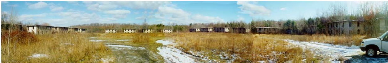
Figure 5. Photograph of Concrete City

local inspectors as unsafe from mine subsidence; however, many local residents claimed that it was due to the company not wanting to install a sewer system to support more modern types of bathrooms. Failing to destroy Concrete City by dynamiting it, now the area is a Pennsylvania State historical site (Coal Region, 1994).