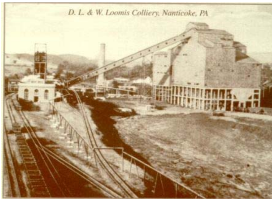
Figure 6. D. L. & W. Loomis Colliery in Nanticoke, PA

For many years between the 1930s and 1970s, the land on which the collieries existed was almost forgotten; nothing was ever developed on it. Over those forty years, depression was rampant, job availability decreased, and the coal industry left Nanticoke and neighboring towns to fend for themselves. Eventually, the area suffered economically due to mine fires, the Susquehanna River breach in 1956, and the advancement into new fuels contributed to the ruination of the area.