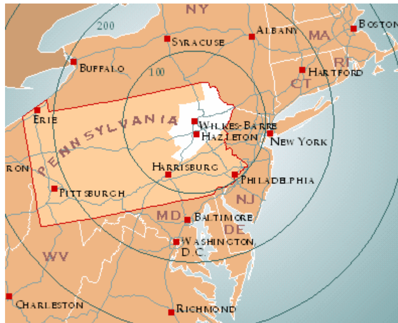
Figure 1. Map of Northeastern Pennsylvania

commerce marked the cities of Philadelphia, Pittsburgh, Bethlehem, Scranton-Wilkes-Barre, Altoona, Erie, and dozens of other towns. At the turn of the twentieth century, the city of Wilkes-Barre alone bragged a population of nearly 80,000 inhabitants. Eventually, changes occurred—the economy shifted as new fossil fuels were exploited and as a shift in business moved westward and southward. Why didn't this prosperous area adjust to the times? The area that includes the Valley is surrounded by natural beauty that today still contains about 400,000 people with an opportunity for them to attend one of more than ten colleges or universities. Within a two-hour driving distance, you have Baltimore, New York City, and Philadelphia, which offer not only a rich cultural experience, but would seem to make the area a “hub” for commerce and industry.