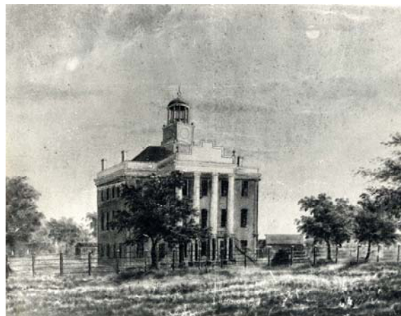
Figure 2. Drawing of Original Courthouse built in 1858 Greek Revival Style. View from Broad Street.

Wind's original drawings are lost, but are referred to in detail in his specifications. His plans called for an 80 x 48 x 48 foot three-story brick structure, changing many of the specifications of the pattern requested by the Inferior Court. All exterior walls were to be plastered and to be colored burnt-umber or fawn and to be scored to three by one foot sections to resemble stone. There were to be two porticos at each of the two entrances on the second story. The courthouse was designed with columns on three sides, but the Jefferson (north) side fell during construction, killing two men. Columns were only added on the East and West sides at Broad and Madison Streets (Rogers, 1963; Peters, 1983).