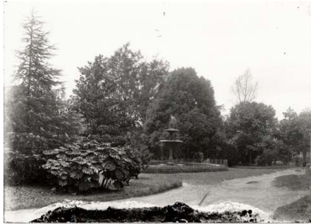
Figure 7. Fountain moved from the Mitchell House to the Courthouse grounds