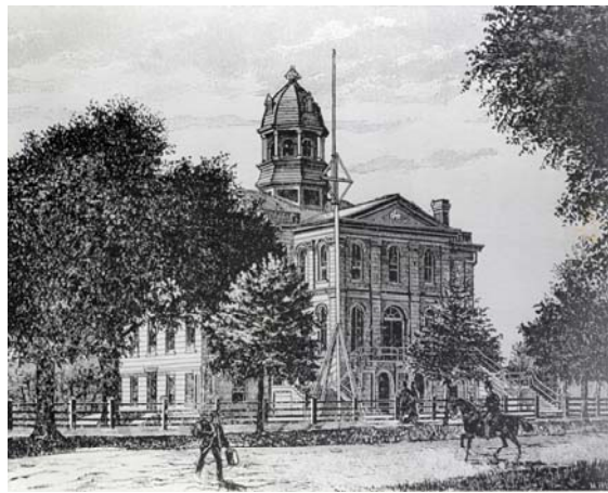
Figure 4. Drawing of 1888 Courthouse in the Italianate Style. View from corner of Broad Street at Jefferson Street.

to complete a remodel. The front portico and rear porch were enclosed and the columns on the East and West elevations removed. The windows were changed to Italianate style, with “rounded and segmented arches” (Caldwell, 2001 and Peters, 1983). This more refined style was a better reflection of Thomasville’s new stature as a resort town. The new Italianate styling was contemporary and considered more sophisticated than the brick Greek Revival building (Caldwell, 2001).