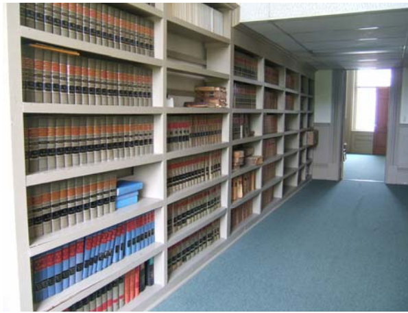
Figure 9. View of interior showing carpet covering and lowered ceiling.

The interior of the courthouse has been modified. The brick and wood floors in Wind's design are currently covered or replaced with tile and linoleum or carpet. The chimneys have been enclosed. The interior stairs no longer wear Wind's rich chocolate color, but have been painted beige. None of the original doors appear in the current courthouse (Jaeger and Pyburn, 1992). It is Pyburn's plan to restore many of the original features, by uncovering the floors and ceilings in addition to making repairs and resolving the ongoing problems discussed earlier in this chapter (Dozier, 9-12-06).