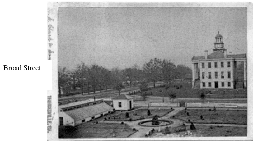
Figure 6. View of the 1858 Courthouse and grounds from Washington Street