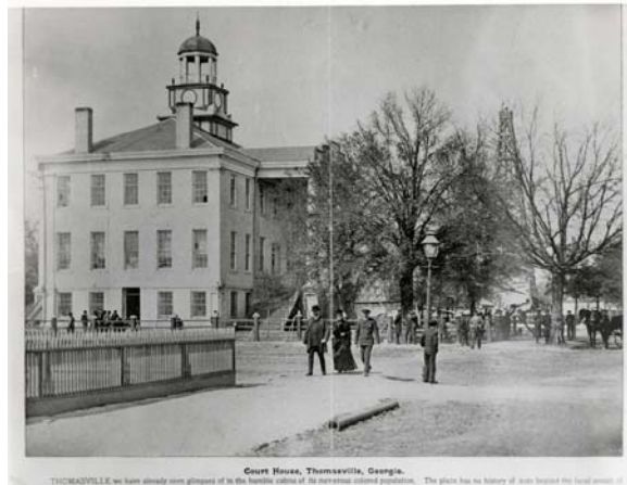
Figure 3. Photo of 1858 Courthouse showing public life. View from Broad Street at Jefferson Street