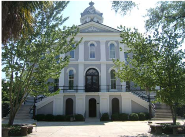
Figure 8. Thomas County Courthouse in 2006. View from Broad Street.

Some of the renovations have addressed issues of safety. A grand jury in 1978 called for fire safety as a major priority for the courthouse because there were six violations from Fire Marshall's Report dated May 24, 1977. These included an inadequate number of exits, and signs designating such marked with lights, unprotected vertical openings such as stairways, elevator shafts. The courthouse needed to update their electrical wiring to conform to national standards and remove combustibles from the elevator shaft on the second floor. The grand jury noted several leaks, rotting floor boards, chipping and peeling paint, filthy windows, and haphazardly stored cleaning supplies in hallways among other violations. They recommended repairing the roof, installing hand rails on both sides of stairs, repainting woodwork and cleaning the windows (Freedman, 1978).