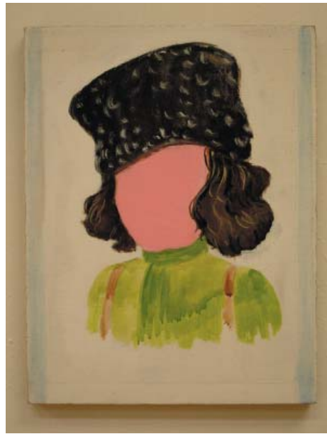
Fig. 16, Untitled, 2005

I chose a portrait of a distant relative as the subject for my newest painting. He used to be a soldier in a band of anarchists, and his gaze expressed a determination that looked similar to the faith I saw in the ancient icons. I painted an image on stretched and gessoed white linen with acrylic paint (Fig. 16). It is a three-quarter-view bust. I left his face blank and covered it with pink paint. I have noticed a strong similarity between this portrait and my memory of the Black Swan, whose pale feminine face was framed by his long hair.