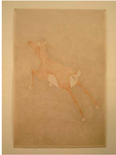
Fig. 12 Reed, 2005

I used a 24” x 36” sheet of a newsprint paper, positioned vertically, and two colored pencils (white and burnt sienna) to draw a deer leaping forward in a three-quarter view. In my drawing, however, I replaced the deer’s tail with its head and attached the tail to its neck. Instead of placing the deer in its expected element, I omitted “natural” environment and covered the background with monotonous grey hatching. As a result – and even though my deer was represented moving forward towards the viewer – the reversal of its head and a tail suggested movement in the opposite direction. The drawings vertical orientation physically blocked any suggestion of movement. Instead it created a sensation of a physical and mental suspense, which was reinforced by visual complexity, and the