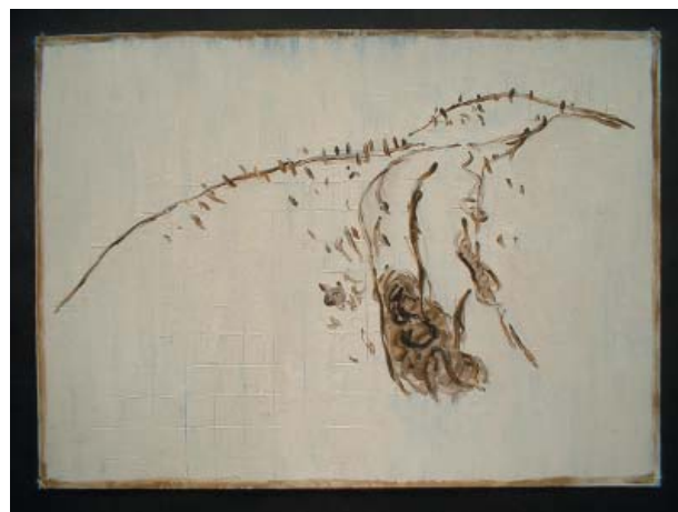
Fig. 3 Palouse, 2003

For my first painting I chose a very loose and gestural drawing of fields in the Palouse country of Eastern Washington. I covered an entire 14” x 20” mat board with the background color and then applied the grid by scratching through the layer of oil paint to the gesso. Then the drawing was copied accurately with a paint brush using another color wet-on-wet technique. I decided to smear the background paint in order to partially conceal the grid. I believed that the obviousness of the grid, which complimented my drawings, would interfere with my intention to represent a purity of expression in the painting. The completed painting gave the impression of a genuine experience, but the remnants of the grid created an unorthodox feeling of doubt and some uncertainty about the original intention (Fig. 3).