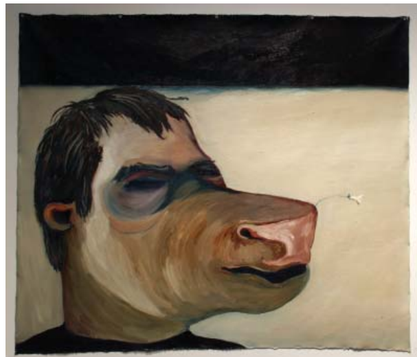
Fig. 1 Cabeza de Vaca, 2002

One day, after a painting session like that, I was driving through the Palouse backcountry in Eastern Washington. I stopped at the crossroads for a red light and I saw a little cow farm across the street. It was late in the fall and some of the grass had already started to turn color. There was a cow laying on the ground and chewing its cud with its eyelids closed or semi-closed. The cow's mouth opened and closed with monotonous rhythm; it captivated me. I stared into the cow's black hole mouth. I didn't think, just stared. I went back to the studio and painted a huge human head with a cow's snout in place of its human nose, lips and chin (Fig. 1).