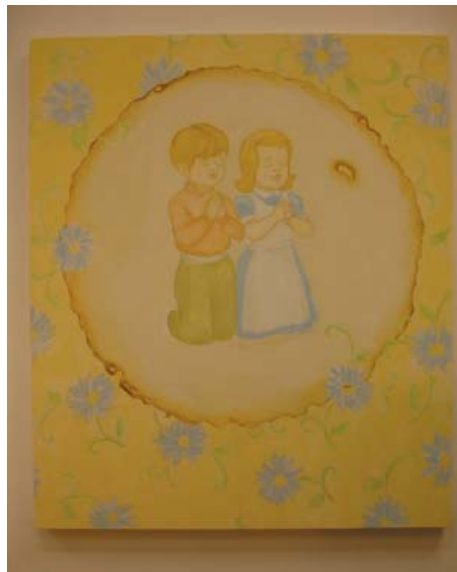
Fig. 17, Quiet Pleasures, 2005

I conceived a synthetic painting about the quiet pleasure of being secure, of having a base under one's feet (Fig. 17). This is oil on canvas, forty inches tall and thirty-six inches wide. The imagery derived from the sarcastic idea, once expressed by the artist B. Wurtz that the three important things in life are sleeping, eating and staying warm. These, in my opinion, are the three most important ingredients in complacency, the quiet satisfaction with an on-going and secure situation. The entire surface of the canvas is covered with a design, borrowed from a bed sheet given to me by my mother. It consists of stylized pale blue flowers situated on a pale yellow background. A large, pale crepe is suspended in the middle of the composition, the crepe situated little higher than the intersection of the diagonal axis.