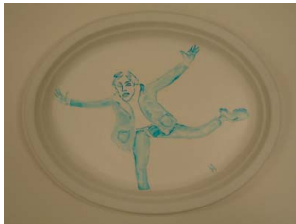
Fig. 13, Untitled, 2005

on one leg while spreading his hands far apart and bends his torso forward (Fig. 13). His other leg is bent backward into the distance. The man’s eyes are wide open and he stares meaningfully at the viewer. Loose hair and an unbuttoned suit suggested the sublimity