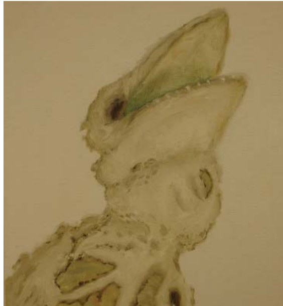
Fig. 8 Lizard, 2004

to animate them in my work. I decided to elaborate on the idea of removing the “pursuit of life” from the representations in my work. The most interesting subject for this concept seemed to be a human portrait. My aunt taught history and the theory of Marxism-Leninism. She had great stamina, which drove her through her life and resulted in a vivid sparkle in her eyes. I painted a large-scale portrait of my aunt while removing that spark (Fig. 9). To do this, I omitted the representation of pupils from her eyes. I depicted the rest of her face with inconsistent brushstrokes; the paint was translucent enough to expose the surface beneath it. It seemed that the whole image was ready to disintegrate into pieces or to dissolve into a grey mass. These portraits - the lizard and my aunt, though different in subject - seemed very much alike. The visual and physical combination and transformation of one into another and back seemed highly possible. The represented subjects didn't contain energy within themselves, but the technique celebrated painting's ability to simulate extraction of energy. It possessed energy to extract an appearance of energy. Energy brought the idea of using food as a concept in my work.