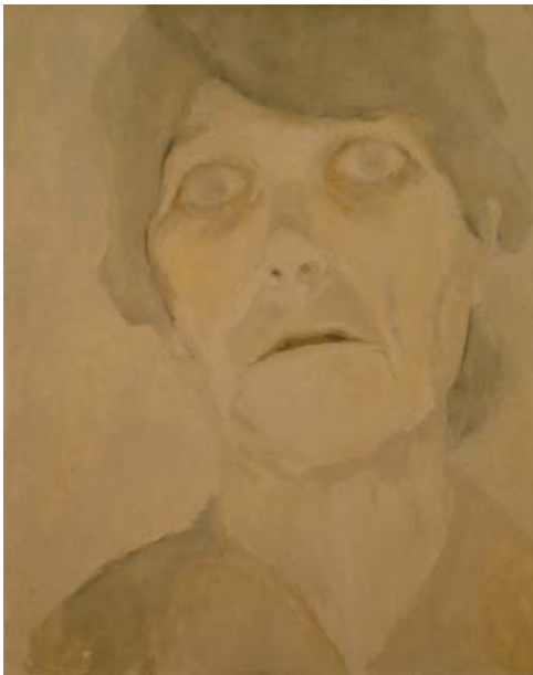
Fig. 9 Aunt, 2004