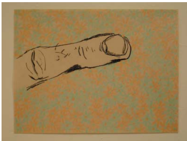
Fig. 14, Untitled, 2005