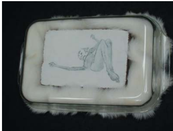
Fig. 11, Untitled, 2004

The simplicity of the rhythm produced the effect of an economy as well as lightness of expression. By lightness of expression I mean the effect that all the ingredients of a piece seem to belong together naturally and without being forced. These ingredients being disentangled from the reality of the physical world were bound together as a necessary combination. Images appear in the moment of detachment from the constructed self, the poetry of images. Images are come and go and the consciousness doesn't hold on to them. Any reproduction of the images is a journey into the past to the moment of the first appearance of an image. Such a journey is possible by means of memory. If the memory of an appearance of an image is clear, the representation will be most exact. If an image in memory is partially washed-out, then what is represented is an excavation of an image. During an excavation another detachment of the self can occur and then a new image gets superimposed on the excavation of another one.