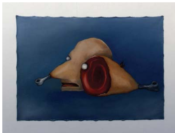
Fig. 2 Mr. Boney - Nose and Ham, 2002

work, what was supposed to be the human nose resembled instead a chicken leg with the bare bone jutting out forward. A big ham was adjacent to the left side of the head. The section of ham was depicted on the same plane as the human face and the ham bone receded backward. The eyes were represented by two white balls painted where eyes would normally be, but one of the balls was situated right on the border between the head