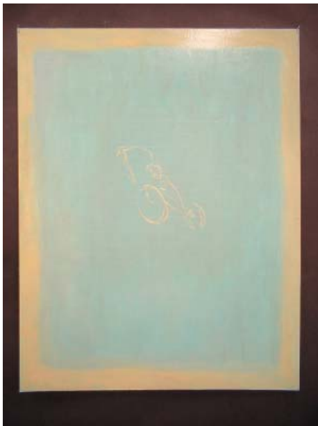
Fig. 5 Stain, 2003