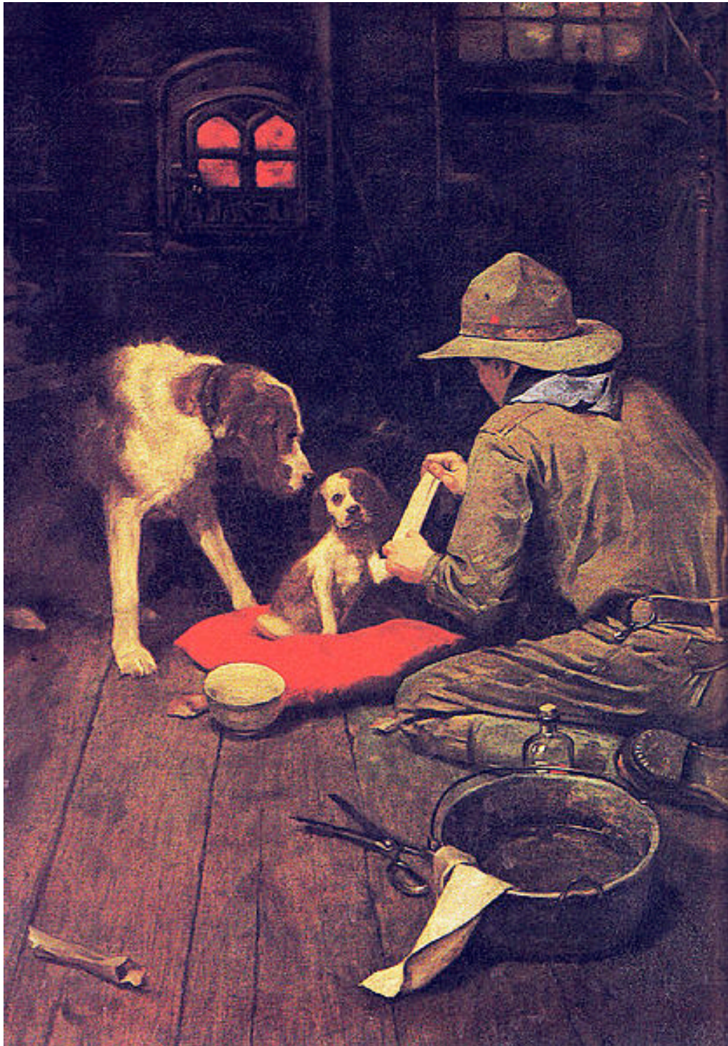
Figure 3, A Red Cross Man in Training 99