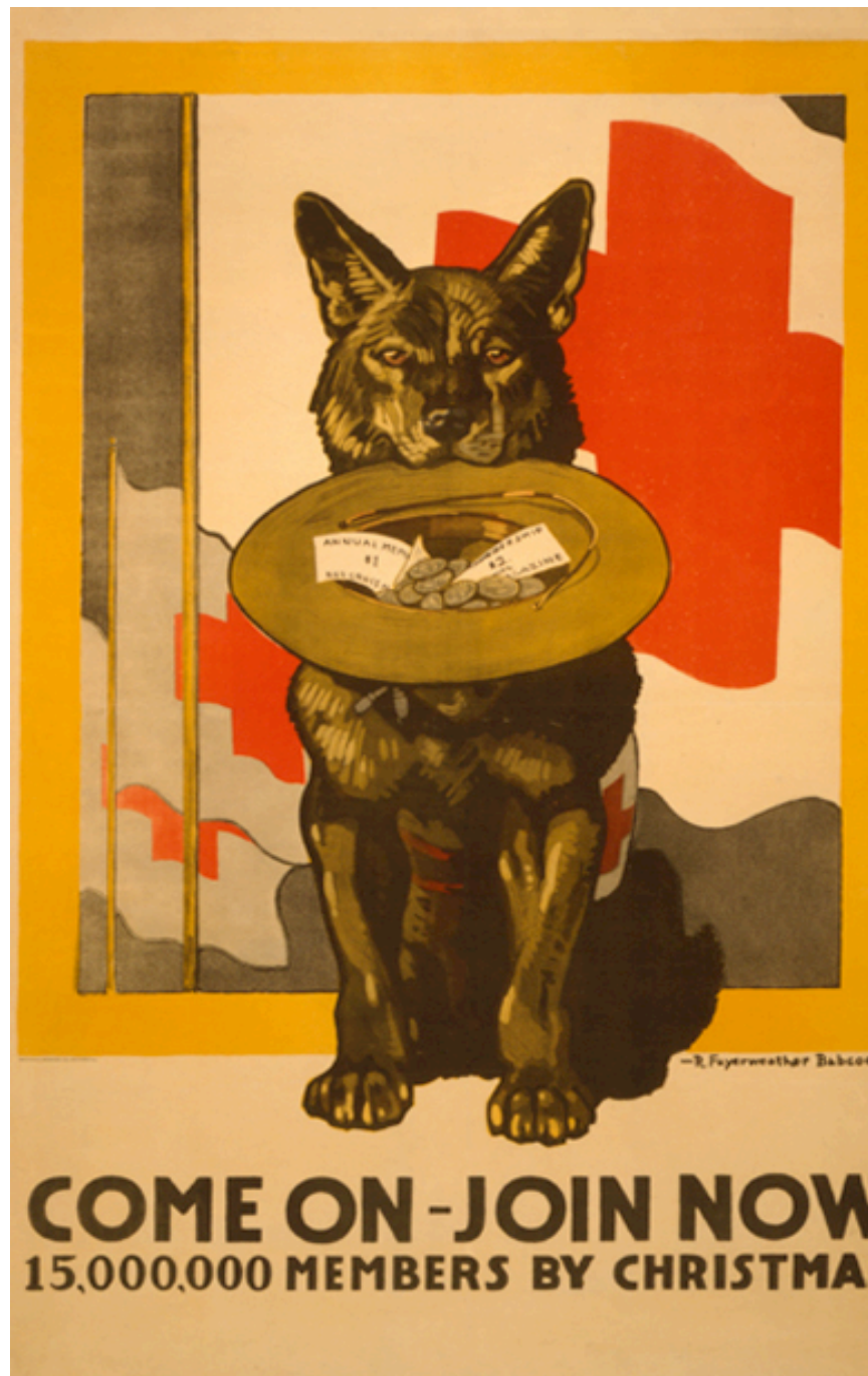
Figure 1, “Come On--Join Now” 97