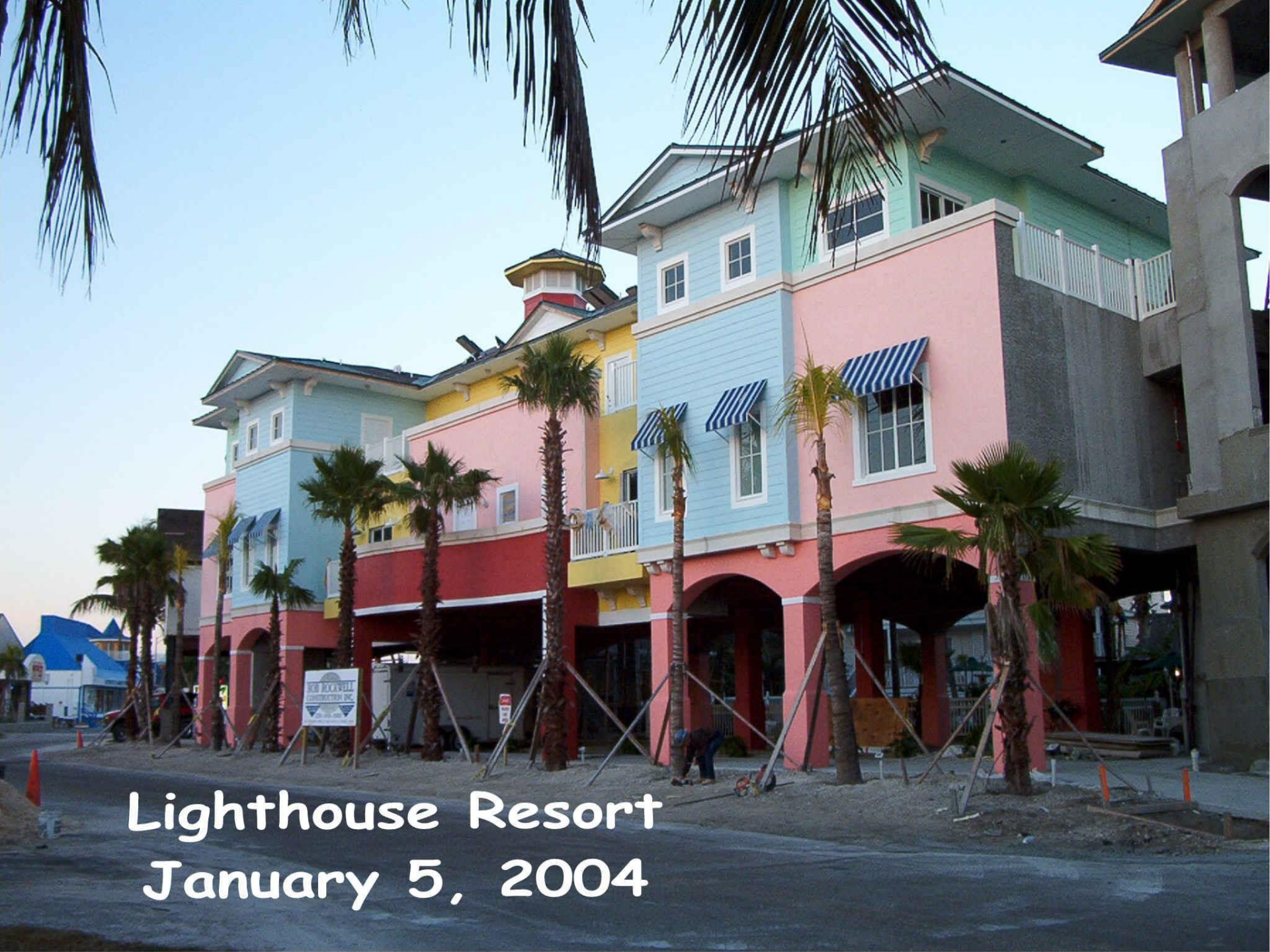
Lighthouse Resort January 5, 2004