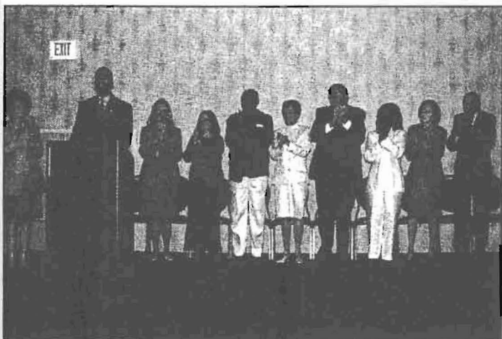
The 2002 Mayor's Arts Award recipients join in welcoming Mayor Ray Nagin to his first ceremony. See page 3 for more on the awards.

A Quarterly Publication of the Arts Council of New Orleans • Summer 2002