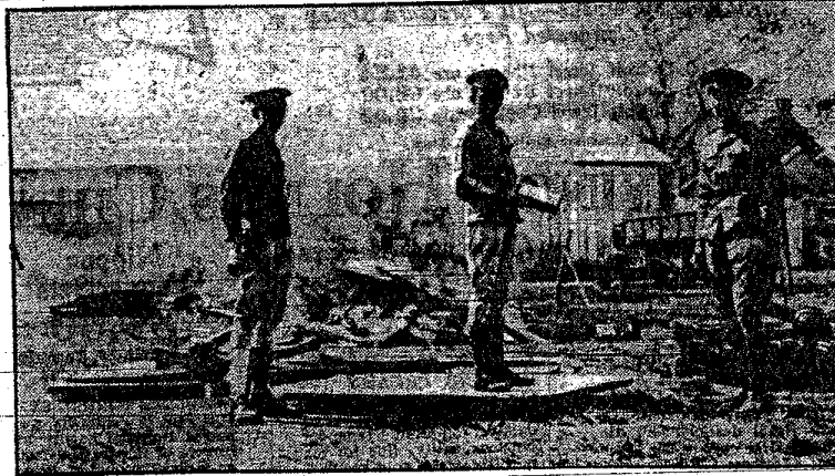
The pieces of battered dice tables were excellent fuel for two fires which the militia maintained at Jackson Barracks following raids on gambling establishments in Jefferson parish Wednesday night. The top picture shows National Guardsmen throwing gaming paraphernalia on one of the fires. A view of the second fire, with Guardsmen in the foreground, is shown by the bottom picture.