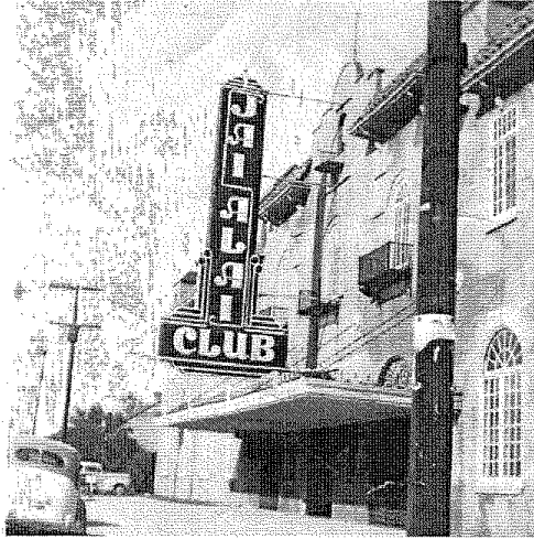
1940'S PHOTO OF THE FRONT OF THE JAI ALAI CLUB ON FRISCOVILLE AVENUE IN THE 1940'S (LEFT)

2002 PHOTO OF THE JAI ALAI PARKING SIGN IN FRONT OF THE D.A.V. HALL ON FRISCOVILLE AVENUE. THIS IS ALL THAT REMAINS OF THE JAI ALAI CASINO COMPLEX