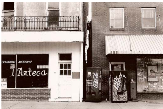
Figure 5: Main St. , 2006, B & W print