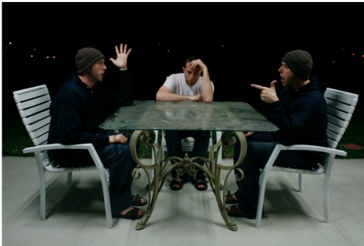
Figure 12: The Argument , 2009

After my abandonment of the Night series I worked for a short amount of time on a variety of simple “one-off” ideas in hopes that one may show potential to be expanded into a larger body of work. These ideas more often than not however, yielded unspectacular results. A new body of work entitled Within Yourself , began out of a simple selfish desire. I had always wanted to see a photograph of me having an argument with myself. “The Argument,” (Figure 12,) was the result.