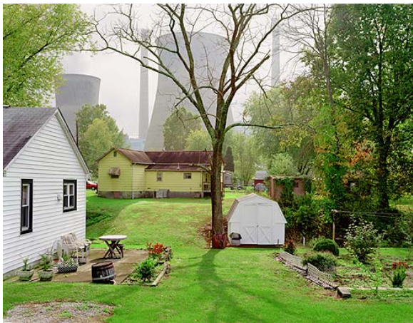
Figure 22: Mitch Epstein, Amos Power Plant, Raymond, West Virginia . Chromogenic Print, 2004.

exemplifies formal mastery with rich subject matter as seen in his photograph “Amos Power Plant, Raymond, West Virginia,” (Figure 22) where Epstein presents a small town in the shadows of a nuclear power plant. An image which is formally beautiful, yet also tells an interesting story as it relates to the American public’s relationship to and dependence upon energy. I feel that this is a direction that contemporary photography must be, and is perhaps already heading in for photography itself to be more readily accepted as an art-form inseparable from other mediums such as painting and sculpture.