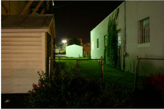
Figure 8: Dayton in Green , 2007

Green,” and though this could have been a direction to work toward in terms of a body of work, it was far from the work I desired to create.