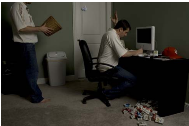
Figure 16: Out of Ideas , 2009

waking up in the morning and preparing oneself for the day. The photo shows me clean shaven and brushing my teeth in person, but my reflection in the mirror displays an annoyed and disheveled self. In another example, “Out of ideas,” (Figure 16) my profession as an artist is on display where I am sitting at my desk drawing out ideas in a notebook, but throwing out an idea represented by a crumpled piece of paper into a trash can which is being held by myself in the left of the image.