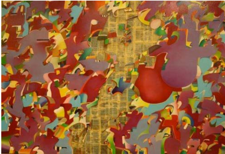
Figure #2: “Two Nations Divided by a Common Language,” 2007, Oil, collage, and stitching on canvas, 84” x 120”

middle of the work, in a sense creating a religious divide amongst two very similar sides to the painting.