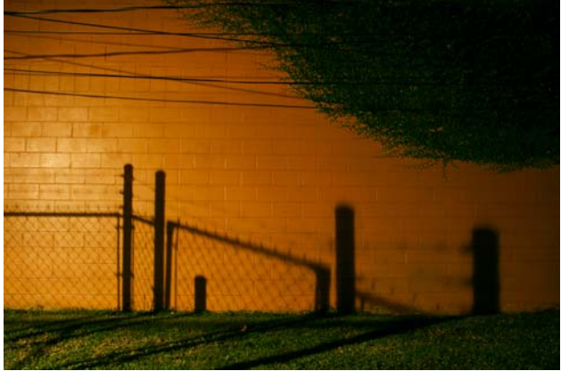
Figure 11: The Red Wall , 2008

the only apparent objects aside from the wall and grass, is the shadow of a fence and several power lines. The photograph is more suggestive, yet less descriptive and allows one to ponder its location, purpose, usage and age.