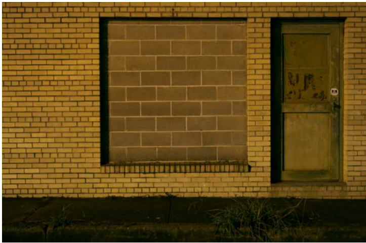
Figure 10: Fortress , 2008

Focusing more directly on walls, doorways and structure fronts, I felt the photographs could benefit by becoming simplified and vague. "Fortress," (Figure 10)