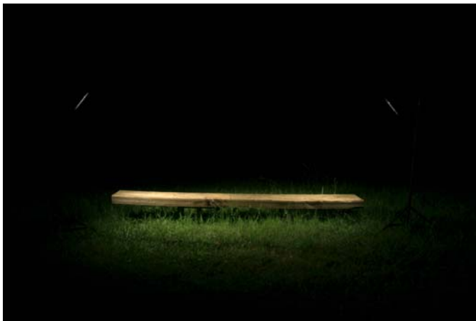
Figure 17: Empty Bench #2 , 2010

I decided to focus the images more squarely on objects I came across at night, such as a bench, game table, grill, boat, etc... This as an objects usage and purpose is easier to define as opposed to drawing that definition from an image of a building's exterior. "Empty Bench #2," (Figure 17) and "Ping-Pong," (Figure 18) are perhaps the best examples of the earliest images of this series.