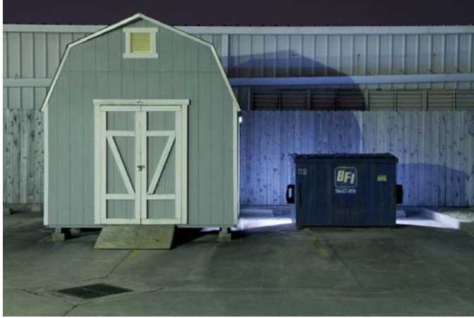
Figure 21: Incoming and Outgoing , 2010

“Forklift Farm,” and “Incoming and Outgoing,” exhibit the most recent characteristics of this body of work. I feel these images display the most successful evolution of this series to date wherein I have finally found a proper balance between formal / technical elements of photography, as well as conceptual strength. These photographs are less direct in their subject matter, yet still pointed enough that one can read into them. They are formally well composed images, yet I feel their technical efficiency does not override their subject matter, but rather enhances it.