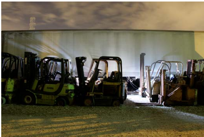
Figure 20: Forklift Farm , 2010

aspects, or objects within the scene, while still allowing my presence or involvement within the photograph to be visible, albeit in a more vague manner. In “Forklift Farm,” (Figure 20) I am underneath the truck trailer popping a powerful strobe light during the exposure. Hence, the main light source is from underneath the trailer, and serves to illuminate the many forklifts which sit in front of it. I feel this photograph takes on numerous subjects including my own personal interaction within the scene, the purpose and history of the forklifts sitting together in this lot, and the usage of all equipment within the photograph.