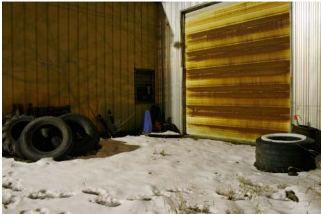
Figure 9: The Tire Farm , 2007

Overall though, the work felt directionless. The scenes I photographed were not necessarily related, as some focused more on particular components of a setting such as a storefront window, or as in “The Tire Farm,” a particular corner of a garage front. While some were more expansive landscapes involving road and sky along with structure. The only unifying component of all the images was the fact that they were all taken at night, a fact which I felt was both too broad and too simple when applied to my reasons for creating the work.