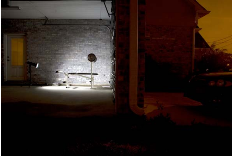
Figure 19: His Workout , 2010

I felt there was a need to put the objects I chose to photograph in context of their setting. The weight-lifting set on it's own could exist anywhere and in any situation, whereas in “His Workout,” it exists in context of a person's house and is clearly seen at the very least, recent usage by that person. Although the image is more direct, elements of narrative are still left to interpretation.