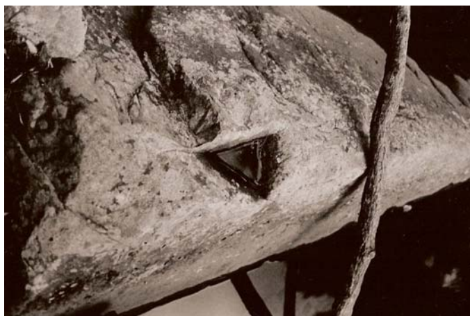
Figure 6: Triangles , 2006, B & W print