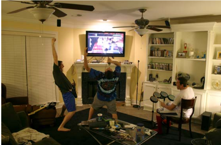
Figure 13: Delusions of Grandeur , 2009

With these first images displaying broadly scoped themes, I placed myself within the image as an archetype not unlike many artists who have done so in the past such as Arno Minkinnen as exemplified in “Jamestown, Rhode Island,” (Figure 14) where Minkinnen contorts his body through the act of diving into water, and thus allows himself to become a natural element to a natural scene. I quickly began to feel that the work was too broad based with its clichéd themes, and perhaps would be more interesting as a self-exploration.