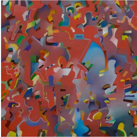
Figure #3: "Adrift in the River's Delta," 2008, Oil on Canvas, 60" x 60"

In this sense, I saw myself moving away from the ideals of Abstract-Expressionism and away from the idea of non-objectivity. At first, this change was brought on based mainly on a desire to explore and produce more conceptually driven art. However, this change was accelerated by a two-fold discontentment with the process of painting itself, and the idea of non-objectivity.