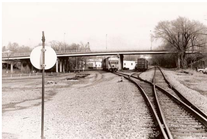
Figure 4: Train Tracks , 2006, B & W print