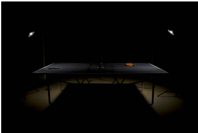
Figure 18: Ping Pong , 2010