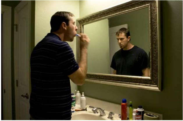
Figure 15: Cleaning Up , 2009

“Cleaning Up,” (Figure 15) is an example of what one goes through when